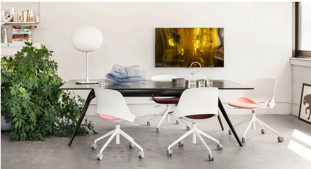
Trea Lite Task, Steelcut Quartet 0534 and 0684