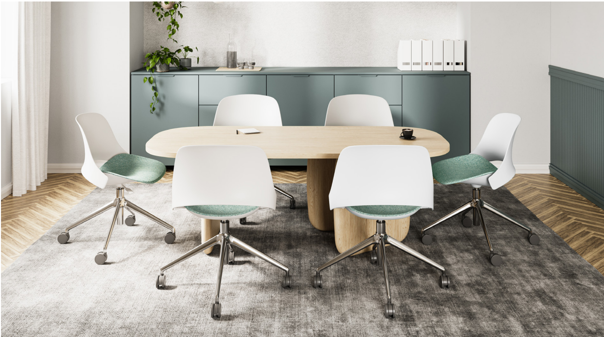
Trea Lite Task, Vanir 0913

Minimalist design lends true versatility without sacrificing comfort, style, or first-class functionality.