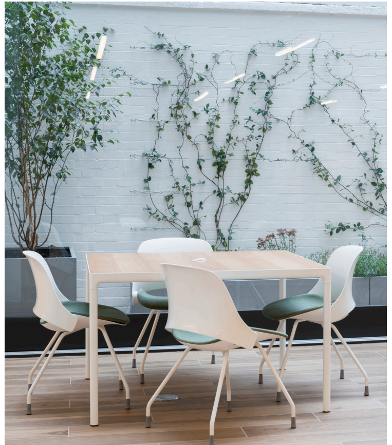
Trea Four Leg, Remix 0906

Ideally suited to a wide range of work environments, Trea brings new lightweight language to high-function design. Its clean, minimalist aesthetic elevates any setting without pulling focus, while the powerful, ergonomic mechanics as its core are instantly felt but never seen.