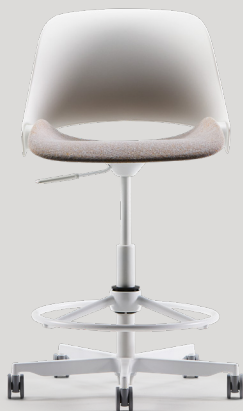
Lite Task Stool T500