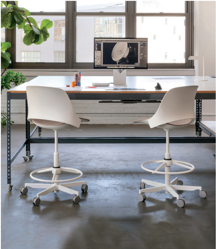
Trea Lite Task Stool, Arda 0201

Minimalist design lends true versatility without sacrificing comfort, style, or first-class functionality.