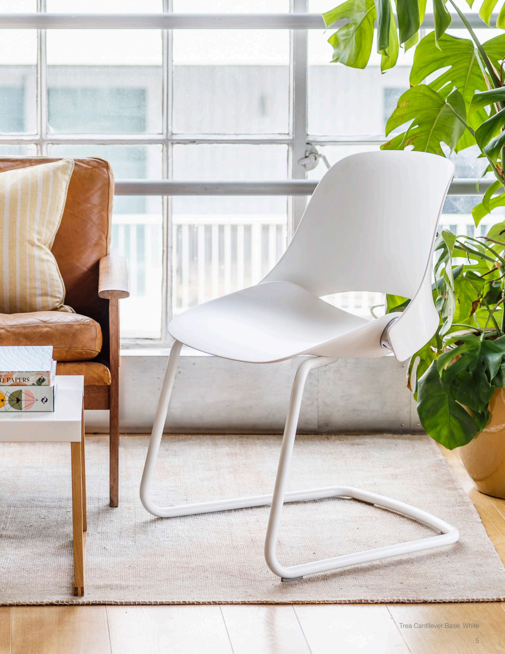
Trea Cantilever Base, White