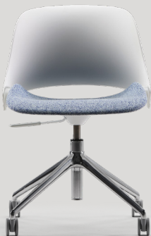
Lite Task T400